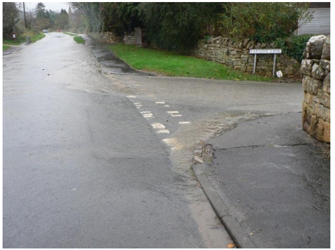
Flow into Parson's Lane