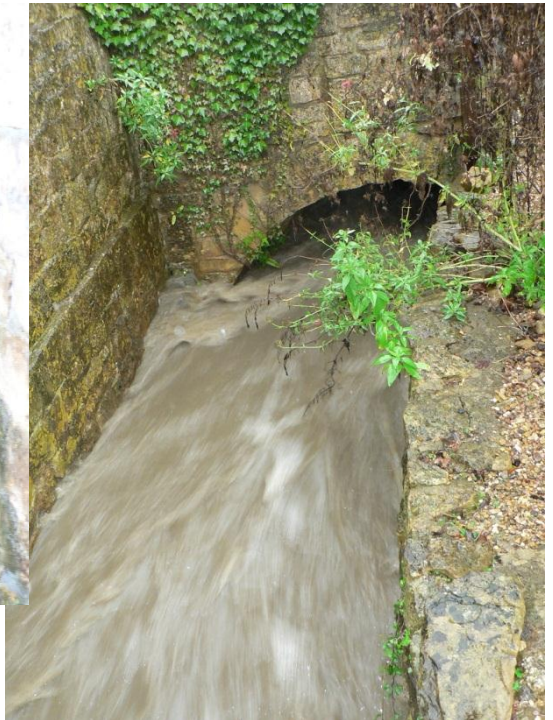
Brook at Friday Street Culvert 18 inches clearance at 12.10

These pictures show the banks of the brook at the Manor Farm monitoring point beginning to be overwhelmed at the peak brook water level recorded on the chart. At the same time the Friday Street culvert coped adequately with 18 inches of head room remaining in the culvert arch. At the rear of Cidermill Orchard the excessively high drainage platform may have caused some back up to Manor Farm and flooding of adjacent patios.