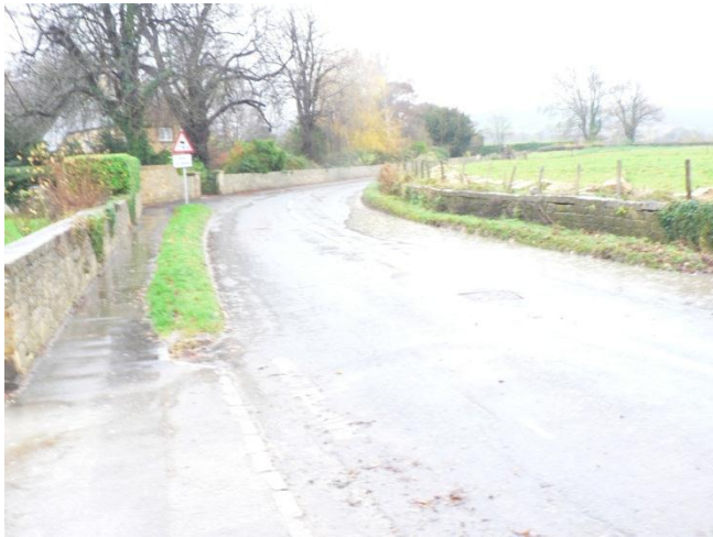
Relatively little surface water at west side of Manor Farm