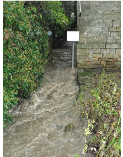
Manor Farm Monitor Point

Corresponding culvert and critical locations at midday