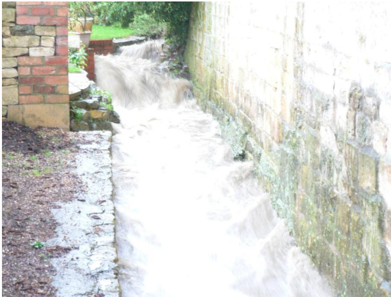
Coombe Brooke at the rear of Cidermill Orchard

Corresponding culvert and critical locations at midday