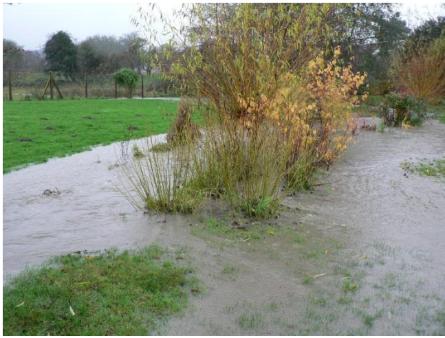
Coombe Brook overflows at Meon Cottage