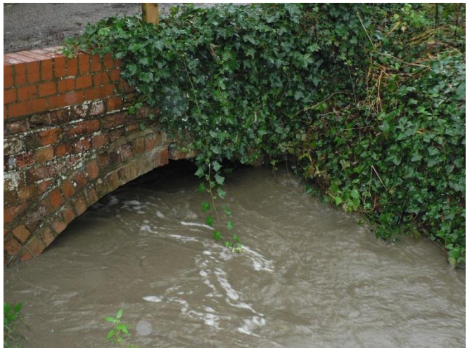
The bridge at the Village Hall